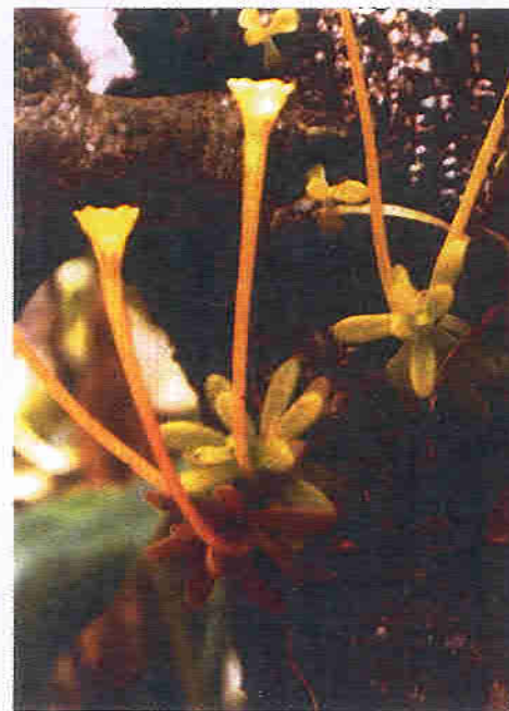
Pinguicula lignicola , Sierra Moa.