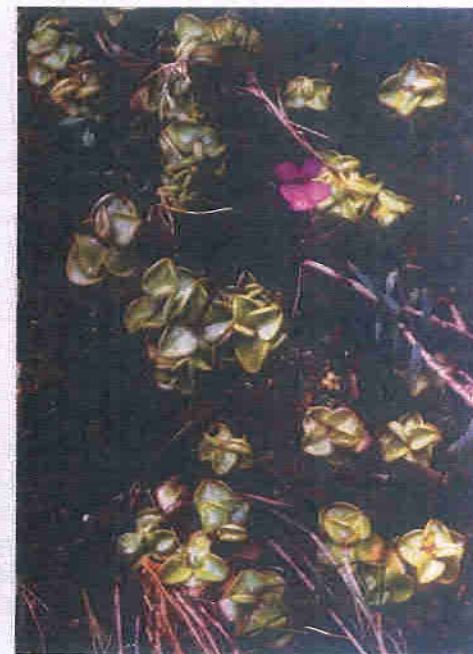
Pinguicula benedicta .