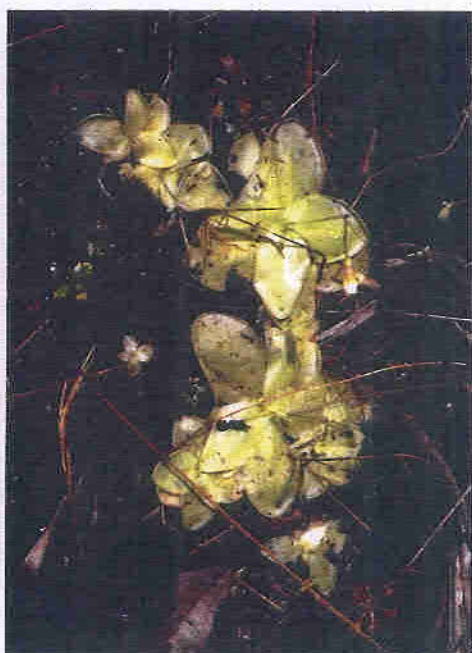
Pinguicula albida , Pinar del Rio.