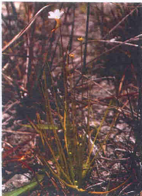
Pinguicula filifolia , Pinar del Rio.