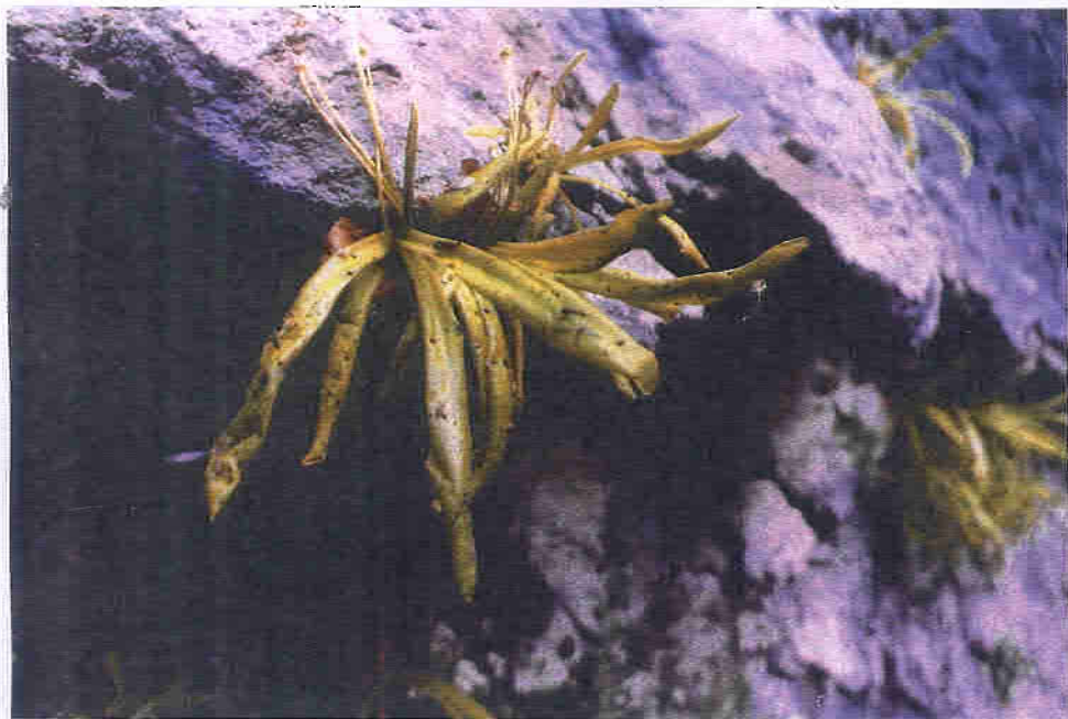
Pinguicula longifolia ssp. longifolia on a limestone cliff, Sierra Marqués.