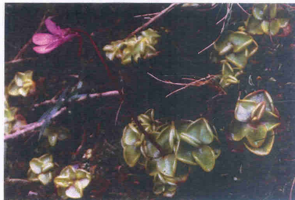
Pinguicula benedicta, Sierra Moa.