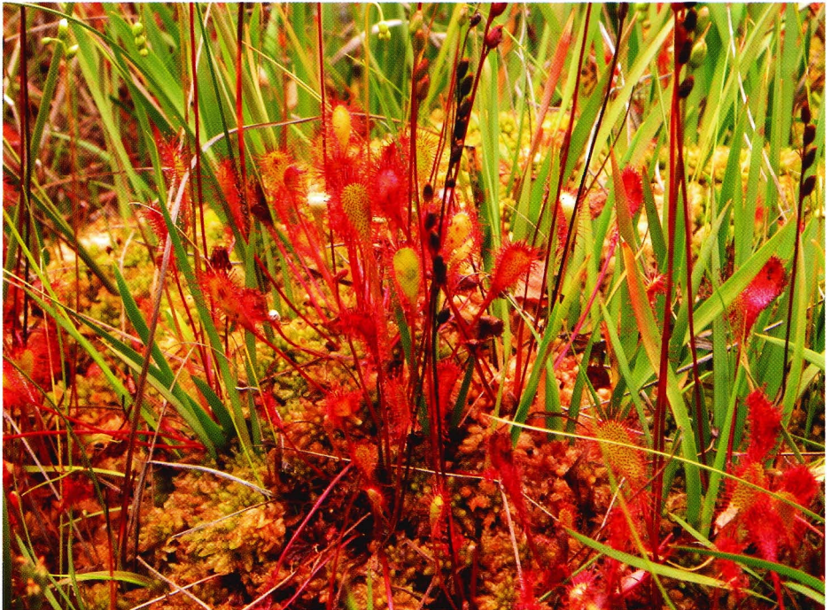
Figure 4: Drosera × obovata at Vales Moor.