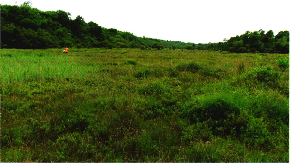
Figure 5: Wootton Bog general view, featuring Aidan Selwyn and Susan Walkinshaw way off in the distance.