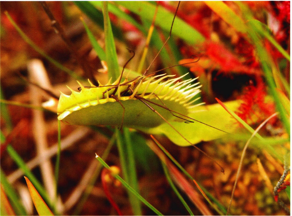
Figure 1: Dionaea muscipula at Vales Moor.