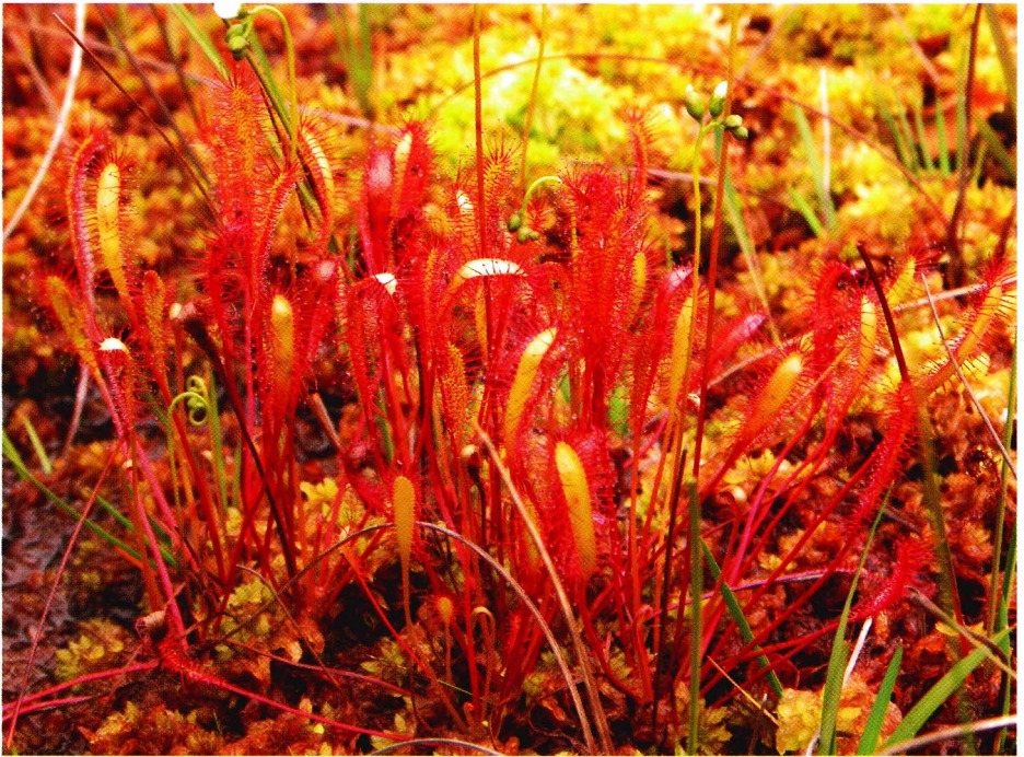
Figure 3: Drosera anglica at Vales Moor.