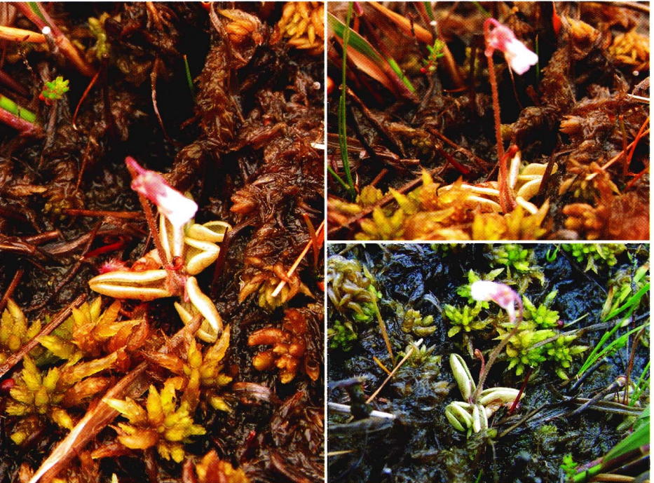
Figure 2: Pinguicula lusitanica at Vales moor.